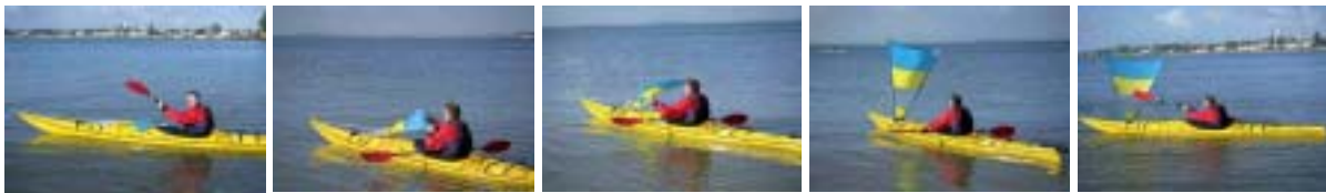
- raise or lower the sail in seconds - adjust the sail shape and run across the wind