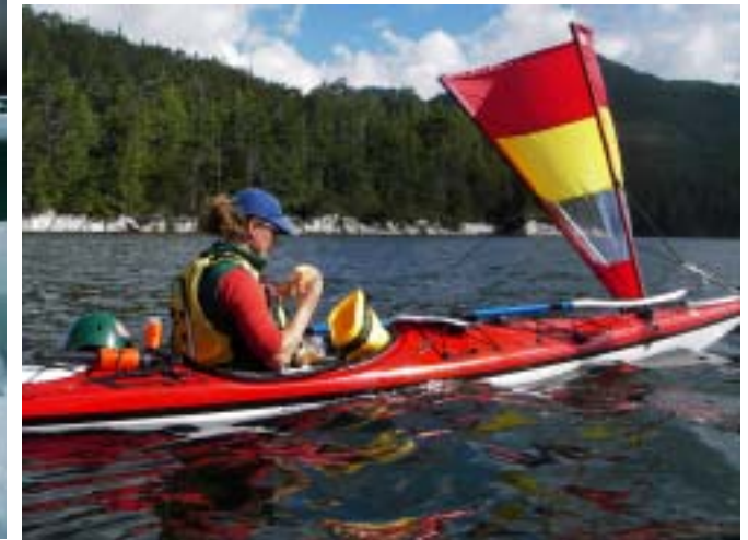
Images show Pacific Action Isqm sails used by Kim Petherick & Lachie Harvey - southozadventurers.com - on their expedition down the inside passage from Skagway Alaska to Squamish BC.