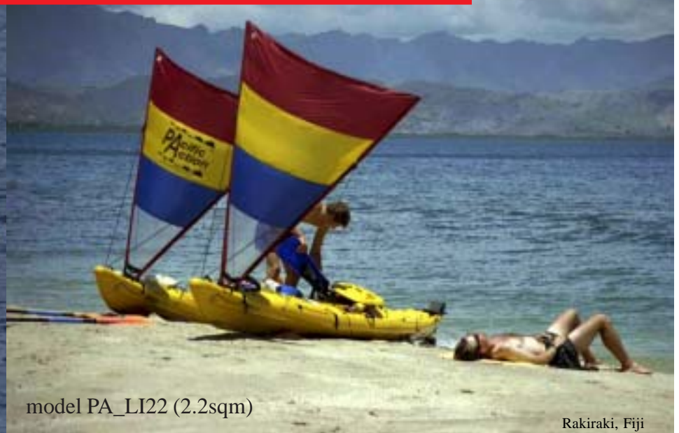
model PA_LI22 (2.2sqm)

© Pacific Action sail systems by On Top Down Under Ltd - 2007 catalog